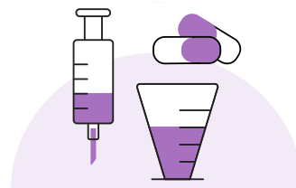
The amount of medicine needed to treat illnesses

In special cases, doctors can access an 'unapproved' medicine. They might do this through Australia's Special Access Scheme.