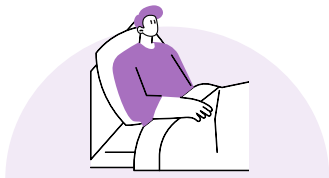
The illnesses it can treat

If approved, the TGA lists how and when to use the medicine. TGA approval lists: