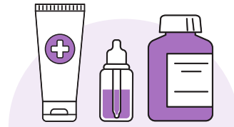
Forms of the medicines available